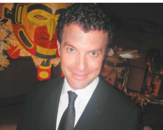
Rick Mercer was master of ceremonies at the inaugural Inclusion Works Gala.